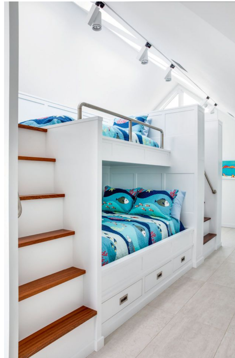
Above, the master bedroom, painted in Ben Moore's Aqua Marina, boasts a panoramic view of the bay and a massive walk-in closet. Right, the bunkroom took seven iterations to perfect. It sleeps nine—two full beds, three twins and a queen—and has custom built-in drawers.